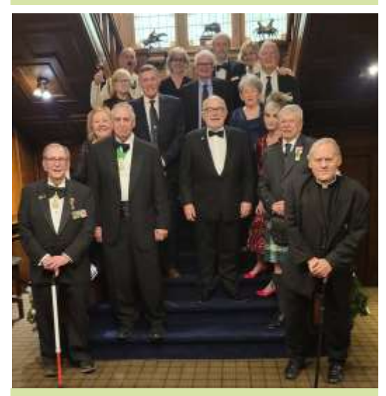
Members of the Calgary Commandery in their finery celebrating the feast of St. Lazarus at the annual dinner.