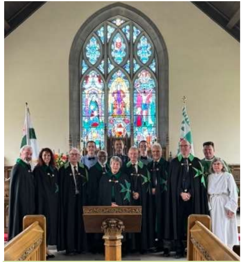
Western Ontario Commandery returns to Huron University College for it's fall church parade.